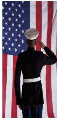
May God Bless America!

be dedicated to the cause of world peace and to be thereafter celebrated and known as "Armistice Day." Armistice Day was primarily a day set aside to honor veterans of World War I, but in 1954, after World War II had required the greatest mobilization of soldiers, sailors, Marines and airmen in the Nation's history; after